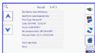
Multiple test data can be stored and displayed for subsequent analysis and download