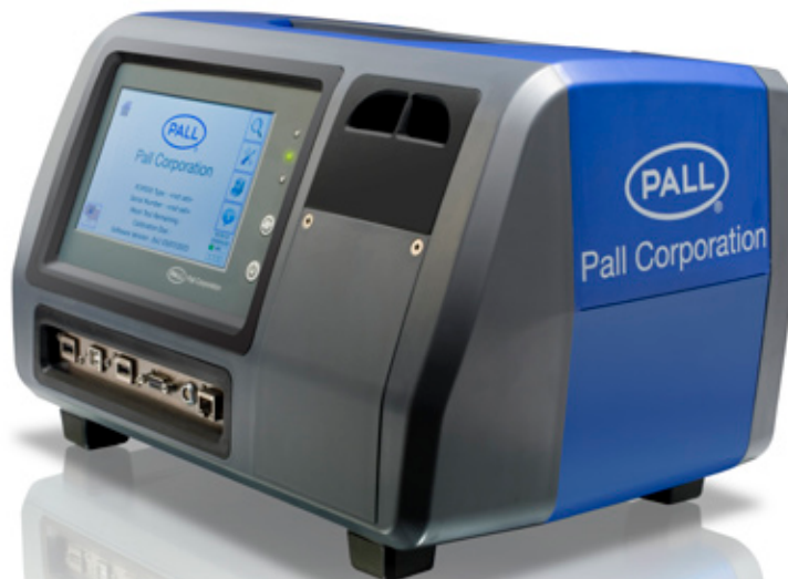
PCM500 Fluid Cleanliness Monitor

*3 part code measured at 4 \mu m, 6 \mu m and 14 \mu m (c) per ISO 16889.